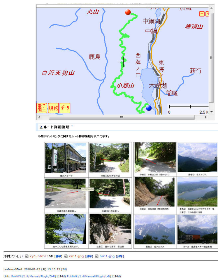
Fig. 4 Outdoor activities map on authors' website