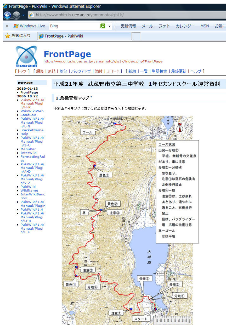
Fig. 3 Hiking route map for risk management on authors' website