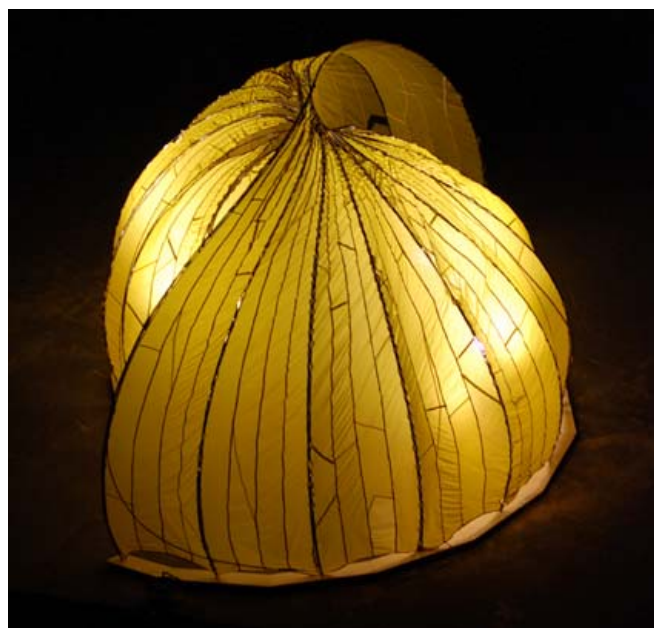
Fig. 3 Illuminated exhibition pavilion "Twister" in Detmold, Germany

of each arc. With the help of photogrammetry the geometry of the rods was digitalized and implemented into the Rhinoceros-Model. Based on this analysis the digital model was adapted to the material conditions from the survey of the rods. The blanks and sizes for the rods and the membrane were finally taken from the so updated model in Rhinoceros into the realization process. The assembly of the exhibition pavilion "Twister" was based on traditional methods of membrane-constructions using sewing-technologies and knot-fixtures.