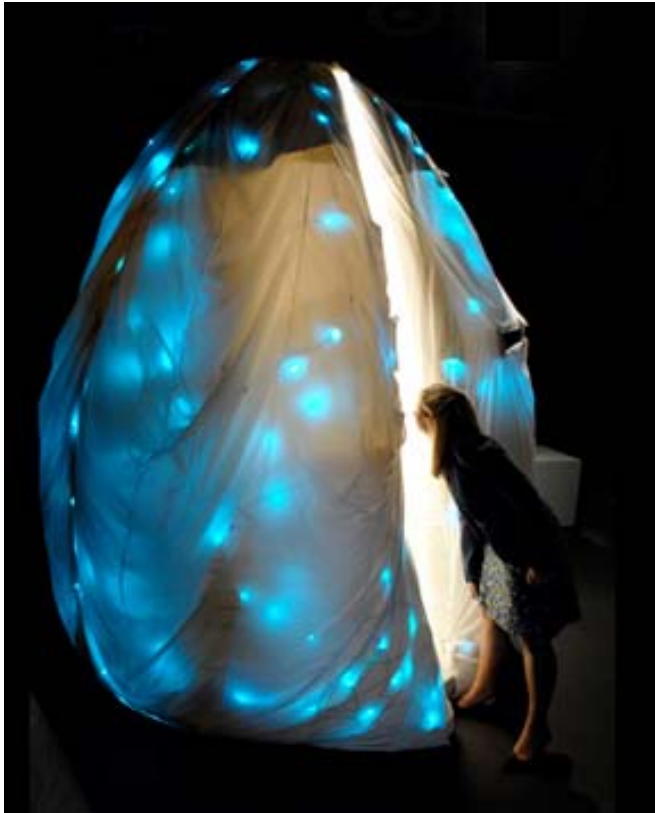
Fig. 4 Corpform (structure partly relaxed) at the Entry 2006 in Essen, Germany

takes over the support function while the shape of the installation changes. Reservoir pads with Phase Changing Materials [3] are built into the load-carrying structure, which activate thermal mass in order to regulate the climate condition of the experimental building. In addition a textile membrane with ceramic layer serves an isothermal function. The constantly changing illumination that is created by a layer of over 300 glass fiber strands visualizes the adaptive properties of the experimental structure.