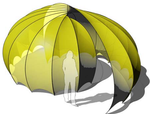
Fig. 1 Digital 3D-Model of the twisted exhibition space

In order to realize the concept of the exhibition pavilion in scale 1:1, the next relevant step was to match the digital model with the methods and conditions of production. The use of Rapid Prototyping technology was well known from the "Printables-project" [1] in 2007 that investigated production methods of complex geometry by using a 3D-printer in order to produce generic scale-models out of digital data. For the realization of a pavilion with a radius of approx. 6 meters and a height of 3 meters other methods had to be developed. For the building process of the low-budget project at the University of Applied Sciences in Detmold we chose – after looking at various options, like triangulated wooden or aluminium panels - a common tent structure based on carbon-fibre rods for the arcs and a textile membrane for the minimal surfaces in-between. Within the planning process the conditions of production (fixtures, element sizes etc.) and the material properties were investigated and implemented into the digital model.