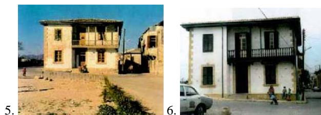
Fig. 5 Before Renovation; Fig. 6 After Renovation

Consequently, the Nicosia Master Plan team advocated a series of integrated priority projects to be initiated as the "Walled City Revitalization Policy." As part of this effort the first steps were taken – in the Selimiye Neighborhood improvement project, the Arabahmet Neighborhood improvement project and the Chrysaliniotissa Neighborhood improvement project – to put emphasis on housing stock rehabilitation, the upgrading community facilities and services, the induction of landscaping and traffic management (Figures 5 & 6 below).