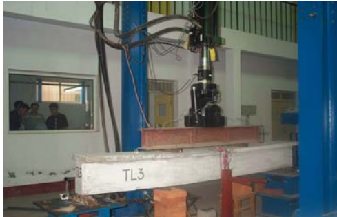
Fig. 2 Photo of MTS

and the pressing area show an agreement to the assumption of the flat section. It can be obtained in the whole process that, with a decrease of the crack width, the service life of ladder reinforced concrete is much longer than that of ordinary concrete.