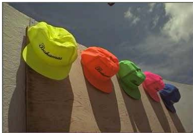
Fig. 1 Original Image of 'hats.jpg'

Fig. 1 represents the original 'hats.jpg' image, while the Fig. 2 represents reconstructed image when chrominance blue is downsampled by the factor 2. Fig. 2 also shows that compression ratio 26.5066 is achieved with the peak signal to noise ratio is 32.9300 & the root mean square error is 5.7549.