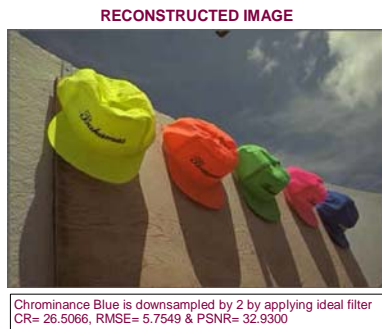
Fig. 2 Reconstructed Image in case of downsampling the Cb by 2