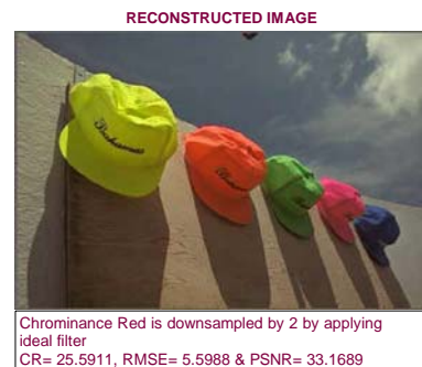
Fig. 3 Reconstructed Image in case of downsampling the Cr by 2

Fig. 3 represents the reconstructed image when chrominance red is downsampled by the factor 2. Fig. 3 also indicates that compression ratio of 25.5911 is achieved with the peak signal to noise ratio is 33.1689 & the root mean square error is 5.5988.