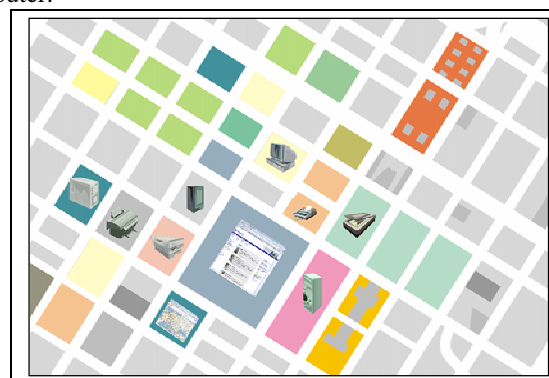
Fig. 1 Overview map

The next graphics give a first impression of how the network surrounding could be presented to the user. By the help of an overview map (figure 1) an extensive orientation in the service landscape is possible. Only the rooftop of each building is shown, which shows a representative image of the service available on that peer. To make it easier to orientate, the streets go orthogonally. One could think of showing the building areas of each peer in either the same or variable size. The streets could either be managed by the peers or by the system as a whole (figure 2). This consequently means that one peer is either having the responsibility for one crossing (model a) or for one area which is framed by streets (model b), whereupon the streets are being added through the user's computer.