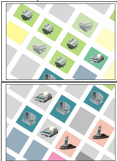
Fig. 3 Views and perspectives a) Perspective=Printing

Figure 3 shows exemplary the change of the map affected by the filter the user employs. It is obvious that peers with similar services are presented in the same areas of the map. This makes it easier to compare the services directly. In order to make the results even more comparable, it is possible without further ado to list the features of peers in a table, using another GUI-component.