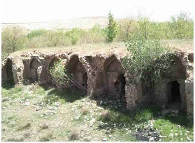
Fig. 1 plants growing between stones (stone caravansary Dokoohak village, Shiraz, Iran)