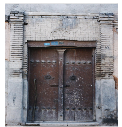
Fig. 6 Damages due to ascending moisture (Jewish Synagogue, Hamadan, Iran)