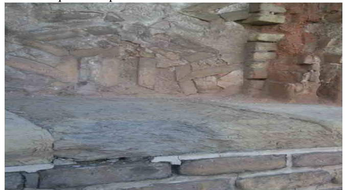
Fig. 3 Decomposition of stones due to acid rains