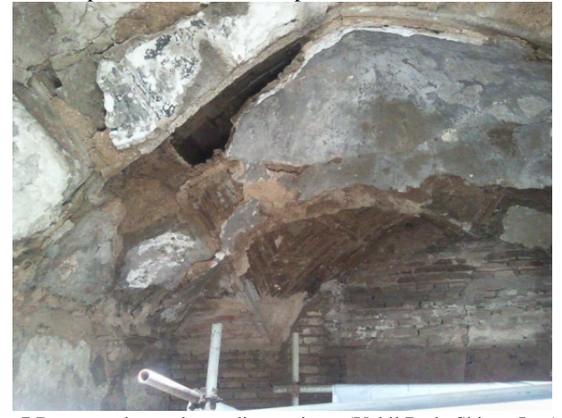
Fig. 7 Damages due to descending moisture(Vakil Bath, Shiraz, Iran)