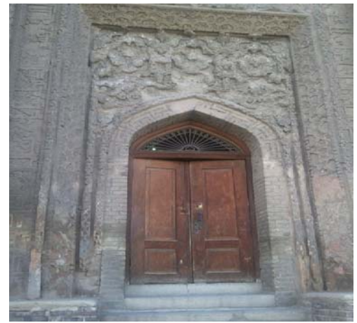
Fig. 4 Moisture along with fluctuations in temperature can lead to disintegration of the façade (plasterwork) in cold regions (Alavian dome, Hamadan, Iran)