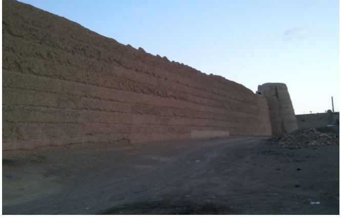
Fig. 2 destruction and erosion of an earthen building due to climatic factors (Damab castle, Isfahan, Iran)