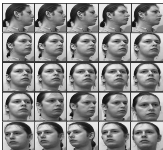
Fig. 1 Sample face images from UMIST database for a single subject are shown.

In this section, the experimental results of the proposed method on UMIST face database [14], [20] describe. UMIST face database consists of 564 face images of 20 distinct persons or subjects. Faces in the database cover range of poses from profile to frontal view. Each subject covers a mixed range of race, sex and appearance. Such as different expressions, illuminations, glasses/no glasses, beard/no beard, different hair style etc. Some images are shown in Figure 2 for a single subject.