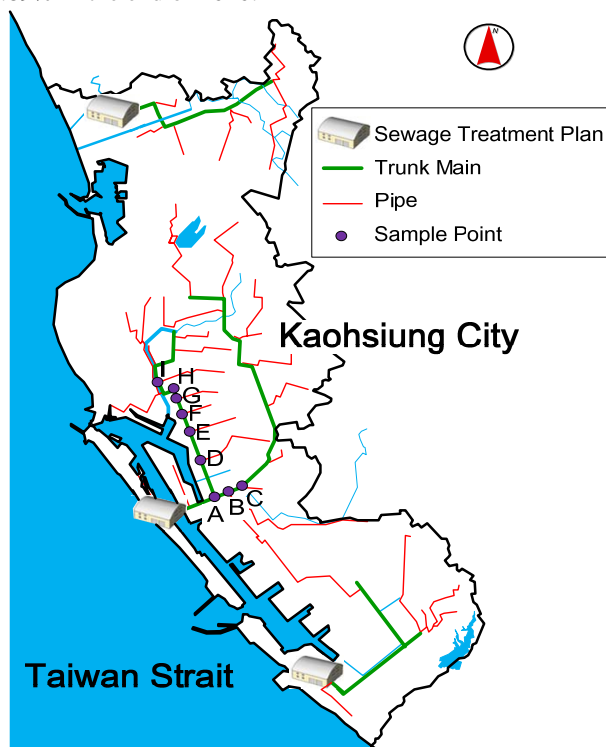
Fig. 1 Kaohsiung City sanitary sewerage and nine sample points [4]

Kaohsiung City is a coastal city with a population of about 1.5 million and becomes the transportation and commercial center in southern Taiwan. Besides, five industrial zones, two export processing zones, and other several important factories such as Taiwan Steel Corporation, Taiwan International Shipbuilding Corporation and Chinese Petroleum Corporation etc. turn Kaohsiung City into an industrial center as well. However, accompanying with the rapid development of Kaohsiung City, environmental pollution seriously affects the life quality of the residents. Before 1989, the domestic sewage and industrial wastewater directly or indirectly discharged into the river and threaten human and environmental health because the sewage connection rate in this city was only 6.5%. Therefore, at that time the Kaohsiung City Government launched the Kaohsiung City sewage system, which is shown in Fig. 1. The sewage connection rate in this city was upgraded to 60.89% in the end of 2010.