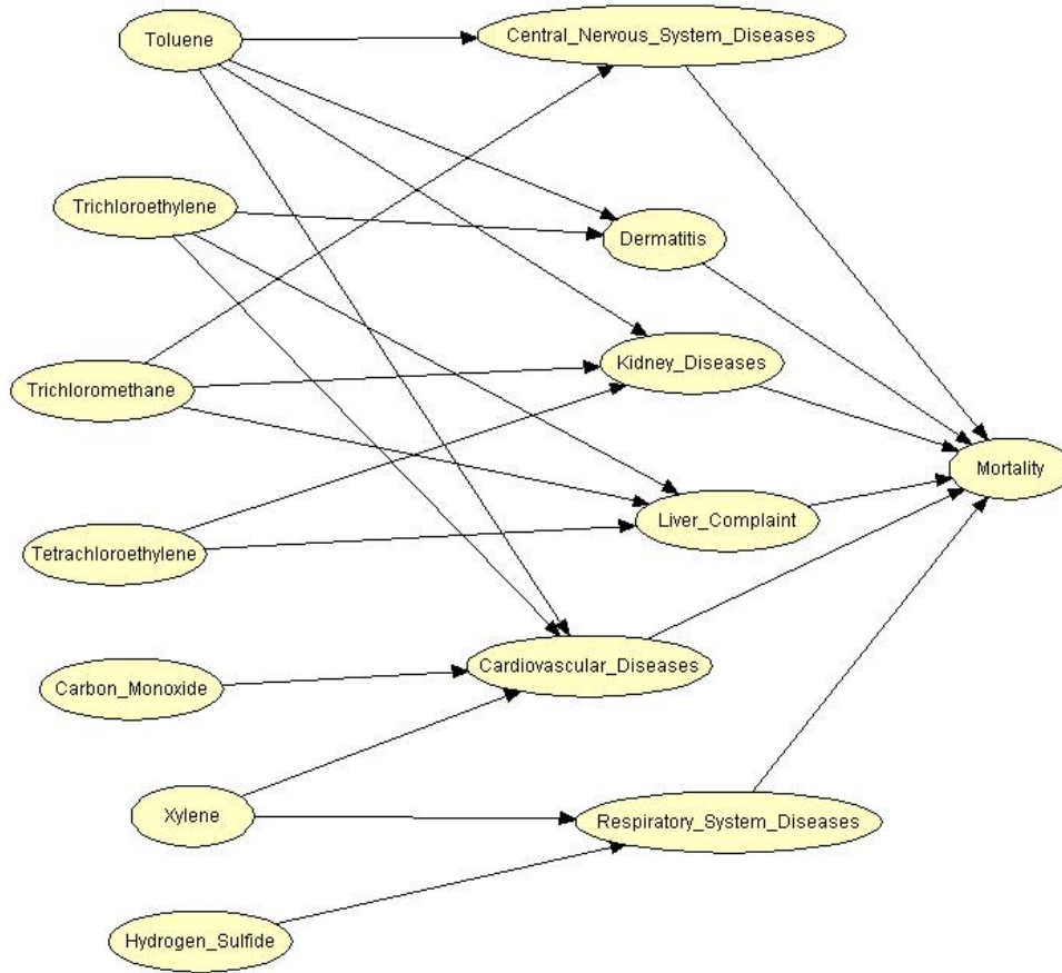
Fig. 2 BBN-HRA structure for hazardous substances in sanitary sewerage