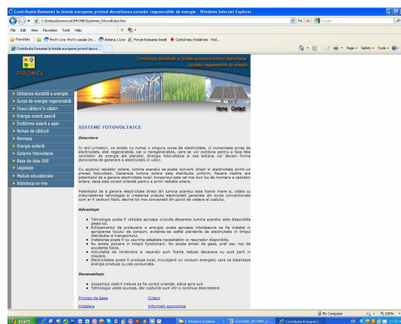
Fig. 2 – PV Systems

A module section covers the following topics: heat loss, passive solar techniques, solar water heating, heat pumps, biomass for heating, wind energy, and photovoltaic cells (Fig. 2).