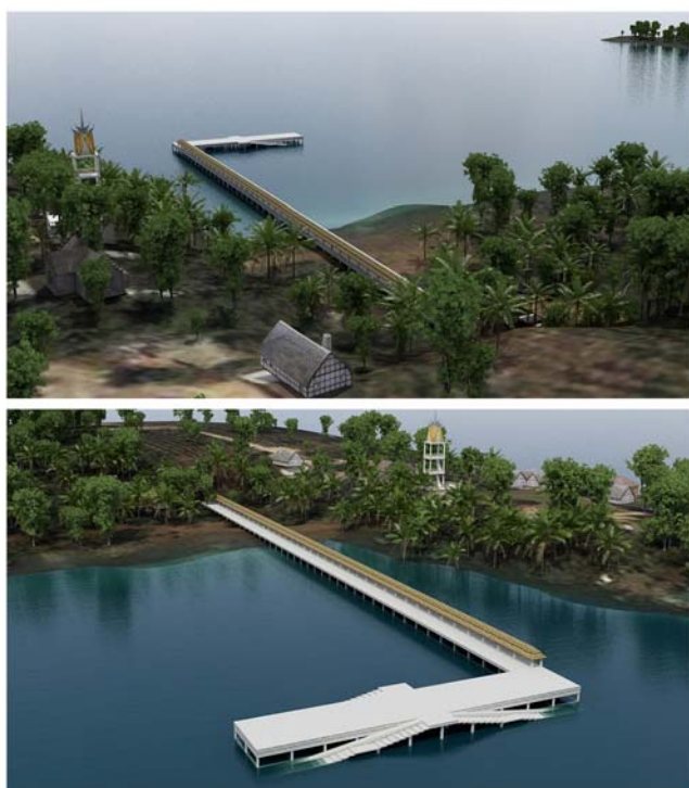
Fig. 2 Artist impressions of the proposed pier at Salad Bay

pier would be used for the transportation of people. The biggest ship expected to visit the pier in the future would have an overall length of 30 m, a width of 5.50 m and a draft of 2.0 m. In order to accommodate ships having a draft of less than 2 m, the safe depth in front of the berth should be deeper than -3.50 m MSL. The engineering design of the new L-shaped pier in Salad Bay specified the pier's length be 210 m and the width 10 m. The berth would be 55 m long, enough to accommodate at least three ships visiting the pier at the same time. The pier structure would be pile-supported in order not to interrupt natural current flows and sediment transportation. The piles would be circular with a diameter of 0.4 m, with a spacing of 5 m in a transverse direction, and 15 m in a longitudinal direction (Fig. 2).