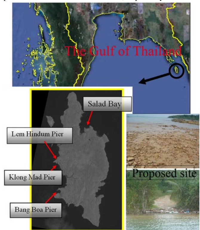
Fig. 1 Koa Kood Island, existing piers and the proposed pier site at Salad Bay

The impact of any alteration of tidal currents is usually considered when carrying out an EIA for any coastal project in Thailand. Prime objectives of this study were to evaluate the change in tidal currents and associated consequences due to the construction of the pier. Readers should be able to use knowledge gained of the process to assess the impact of seawater current alterations caused by any coastal development. The methodology is presented in Section 2, followed by the study results in Section 3. Sections 4 and 5 provide discussion and the conclusion, respectively.