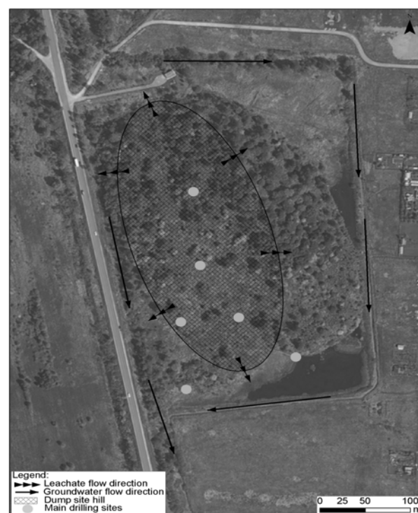
Fig. 2 Kleisti Dump Site (Nr. 1 in Fig. 1) Location of drilling sites, leachate and groundwater flow directions

Electromagnetic data was collected and interpreted in order to plan drilling and sampling sites for evaluation of contamination in soil and groundwater. Drilling works were done with Fraste „Terra - in” and “Iveco” drilling machines. The auger drilling method has been chosen, and boreholes 1-12 m of depth were drilled, including those done through the waste [13]. Temporary monitoring wells were input in sites around and on the dump hill sites. Groundwater sampling and further analysis of possible contamination parameters were done. Surface waters, sediments from ditches were sampled in closest area around these two dump sites on indicative parameters. The odor testing was done for the air sampled from the waste massif, in order to quantify the possible smell emissions while works of re-cultivation would be done. Emissions and gases were calculated based on the U.S. Environmental Protection Agency developed model LandGEM (Landfill Gas Emission Model - Version 3.02.) [14].