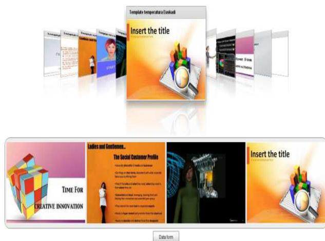
Fig. 2 Collaborative Web Editor

start, maintaining the established order. The user just has to define the order of the elements and when saves it, the system takes the information of the different files and saves in a resultant file.