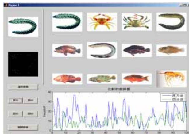
Fig. 3. Results of the CBIR using salient points generated by Song's algorithm.

The comparison between the proposed method and the existing methods is illustrated in Fig. 3 and Fig.4. The query result by salient points generated by Song's algorithm (the proposed algorithm) is shown in Fig. 3 (Fig. 4). The layout of Fig. 3 and Fig. 4 is described as follows. The query image is shown in the upper left corner and we can see the image of the extracted salient points, denoted with white spots, below the query image. The upper right area in the figure shows 12 query results of the experimentation. It only shows a small part of the comparison results for the limitation of the literature. For more detailed information, the figure also lists the small 100 values of Hausdorff distance in the experimentation. The blue (green) curve presents the Hausdorff distance from the query image to 100 images in the database by the salient points of Song's algorithm (the proposed algorithm).