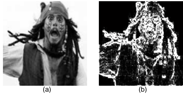
Fig. 1. (a) the original image (b) the points obtained from Barnard detector

For a point in an image, its corresponding saliency value is computed for every wavelet coefficient. We then have to threshold the saliency value, in relation to the desired number of salient points.