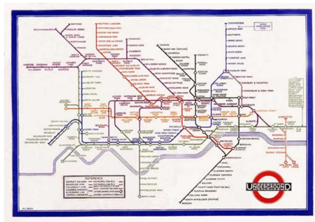
Fig. 3 London Underground Map

This approach, however, is not related only to the physical aspects of the systems, but also to the role of the information 9 , which plays a crucial role in the communication process with the final user [29]. One example of this appropriation can be noticed in the project of the map of London's public transport 10 , created by Harry Beck: