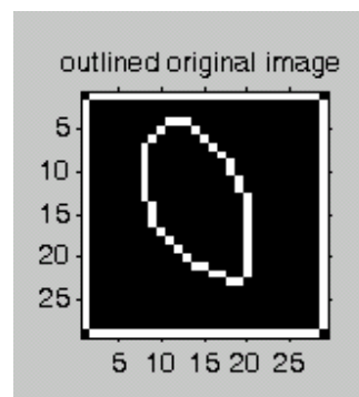
Fig. 1 Image of a head of special sperm after implementation of enhancement and threshold algorithm on the initial image

After implementation of the above-mentioned algorithm, all the background is appeared in a single color and the illumination level of the object is appeared in another color. This leads to an edge formation for the object; as shown in the above figure. Sometimes, a single threshold is used for all the images; but, for the purpose of easy access to the edge of the object that is dependent on the existing illumination levels, a known threshold selection found to be appropriate for the concerned image. Now we have found the edges of our image or have done the segmentation.