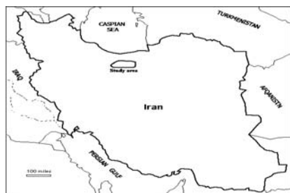
Fig. 1 Location of the study area in Iran regional map

Altitude from free sea level is 1100 m and general slope is 3-5 %. Moderate annual rainfall is 206.4 mm which the most of it occurs in fall and winter and the least of it occurs in summer. Area soils are classified brown-eroded soils with alluvial material. Texture of surface soil is clay loamy and sub-surface soil is heavy-gravelly texture. The slope aspects are eastern and northeast. Enclosures of the study area are divided into two sections include long-term enclosure (45 years, 30 ha, hereinafter 45 EX) and mid-term enclosure (25 years, 20 ha; hereinafter 25 EX). Dominated species are Artemisia sieberi Besser and Stipa barbata Desf along with Stipa hohenackeriana Rupr & Trin., and Salsola Tomentosa Moq. Open area also has Artemisia sieberi Besser as main species. Floristic list of the study area is given in table 1 [2], [7], [11].