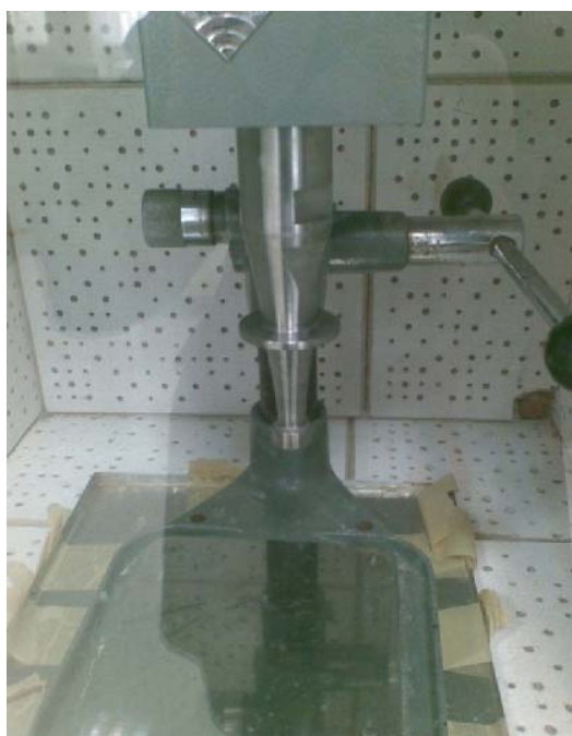
Fig. 1 Sonicator device