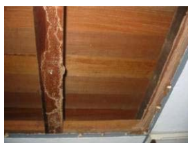
Termite infestation of ceiling Joist

Table I lists building defects that are commonly found in historical buildings in Malaysia. All such building defects may be recorded systematically in pictorial documentation, plans and elevations [7] which the QS may use to perform the quantity take-off for a bill of quantities (BQ).