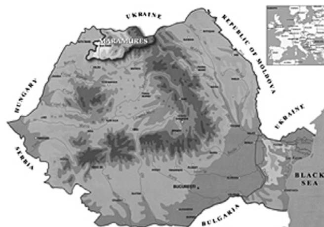
Fig. 3. Territory of Maramureş on the present map of Romania

Thus, adding this clarification to the other information provided by Ottokar's chronicle, it may be concluded that the most likely location of Otto's detention could actually be the Maramures Country (Fig. 3), possession of the Hungarian crown and also placed in the close proximity of Halicz [22].