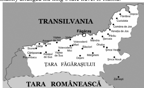
Fig. 2. Fagaras Country in its geographical relationship with Transylvania and Wallachia

a. The vicinity of the Romanians "beyond the mountains" with the Halicz principality, suggested by the fact that Otto, just released from prison (1308), expressed the desire to go to Halicz, but also by the reaction of the Romanian ruler, who instantly arranged the king's safe travel to Russia.