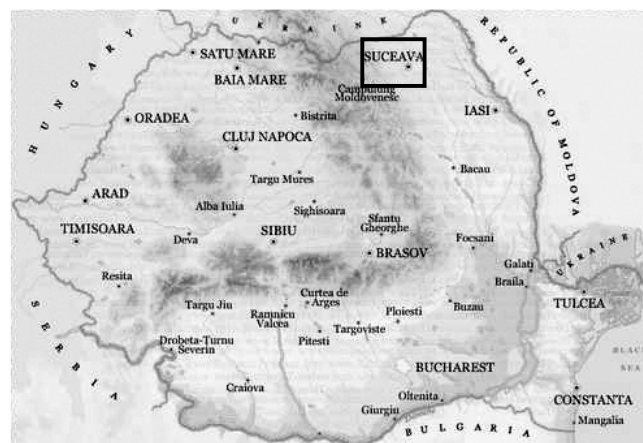
Fig. 1. The geographical position of Suceava on the present map of Romania

From such a perspective, Suceava's example might appear as an expressive illustration of how a medieval site, located on a major river, in a geographical area with a high economic and demographic potential, manages to become the center of convergence of the entire region. This happened in the spite of the city's quite unfavorable, somewhat withdrawn positioning in relation to the principal axes of the international trade [5].