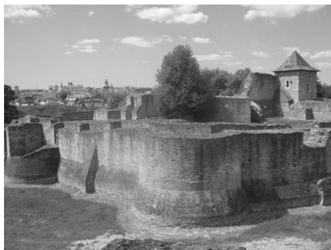
Fig. 5. Suceava. Current image of the princely fortress

Without any reappraisal of already presented arguments [41], one should fully agree to M. D. Matei's assessments of the 1384-1387 interval, as representing the period in which Moldavia's capital moved from Siret. Although the available