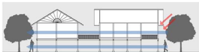
Fig. 2 Natural air flow and sun light penetration in traditional Malay House

velocity helps to increase the efficiency of sweat evaporation, and thus avoid discomfort due to moisture on the skin"[10]. As a result, natural ventilation will improve the indoor environmental comfort as well as creating a better condition level for the occupant.