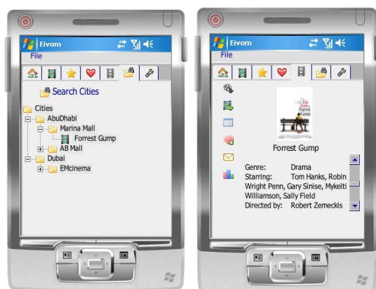
Fig. 3 Search cities and movie information snapshots

We have implemented most of the system features such as search cities, search movies, user bookmarks, user cinemas, movie premier, stream movie trailer, movie details, movie schedule time, offline access to the application, buy tickets, tell friend about movie and rate movie. Fig. 3 shows examples of some implemented features.