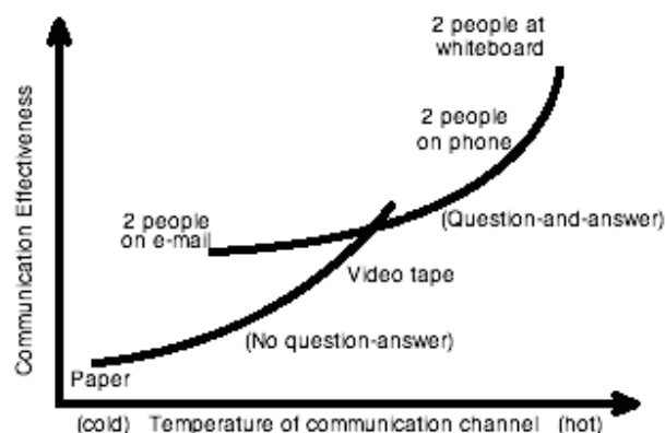
Fig. 1. Effectiveness of different communication channels, based on [10]

Figure 1 shows a graph comparing richness of different communication channels. Paper, for example, is a cold communication channel, as it does not have questions and answers, so is not interactive. On other hand, two people exchanging ideas at a whiteboard is a hot (rich) communication channel. Thus it would be preferable to use warm to hot communication channels to reduce the cost of detecting and transferring information in software development projects.