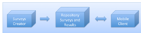
Fig. 1 Initial Block Diagram

The first architecture outlined is illustrated in Fig. 1 below.