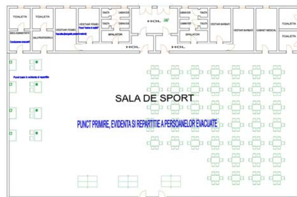
Fig. 2. The way a sport hall have been organised to

cover the needs of an "evacuees reception center" - ERC The components of the Integrated DSS for Emergency Management are: