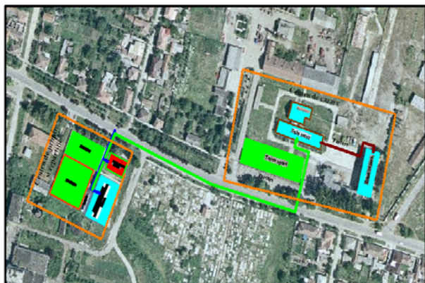
Fig. 1a. The evacuation concept (the evacuee's reception center, the mobile medical point and the accommodation center)

schematically presented in Figure 1a (the evacuee's reception center, the mobile medical point and the accommodation center) and Figure 1b.