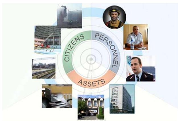
Fig. 1b. The evacuation concept

MAPER - dangerous substances. Mainly task of this component is to identify the characteristics of dangerous substances and estimate the effects of possible accidents involving dangerous substances. This component manages