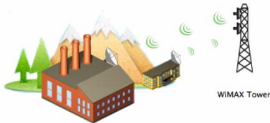
Fig. 1 The WiMAX system scenario for Solid Propellant Rocket Production

The ammunition-manufacturing site is usually situated in the remote area that considered low casualty. The suitable site is usually near the mountains or earth mounds so they act as a blast barrier, blocking the explosion in the case of accident. In most cases, the data link between each plants is required in order to remotely control the machine in hazardous area or access explosion proof security network camera. In solid propellant rocket production, the connection from the office center to several plants can be simply established by deploying WiMAX. A point-to-multipoint WiMAX tower can rapidly create secure high-speed connectivity among plants which overcomes the difficulty of wiring fiber optics in mountainous region (see Figure 1).