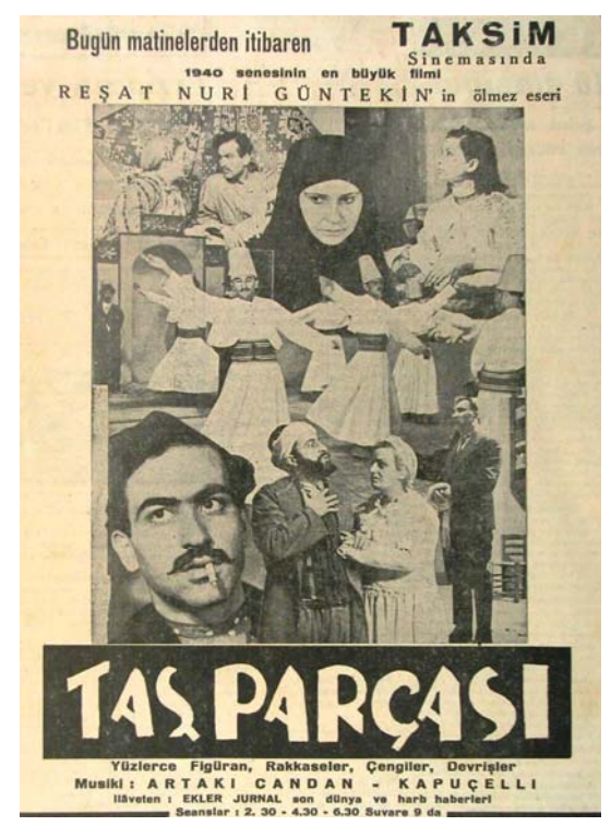
Fig. 5 The advertisement of Taş Parçası is a unique collage designed by the oriental elements from the movie. (Cumhuriyet Gazzette, 29 December 1939)

After Kemal Film and Ipek Film, a new production company and film studio i.e. Ha-Ka Film was constructed by Halil Kamil in 1939. Ha-Ka Film's first film was Taş Parçası ( The Rock ), shoted by a young director, Faruk Kenç. Unlike from movies of Muhsin Ertuğrul<sup>7</sup> [34], [44], [46] Taş Parçası was about the traditional life of a middle class Muslim family (Fig. 5). Because of this reason, it drew attention from the common audience. With its subject and characteristics Taş Parçası exemplified a new breath in the cinema. This new period in Turkish cinema has been called as thetransition period meaning a transition from Muhsin Ertuğrul's period to a new generation of filmmakers'.