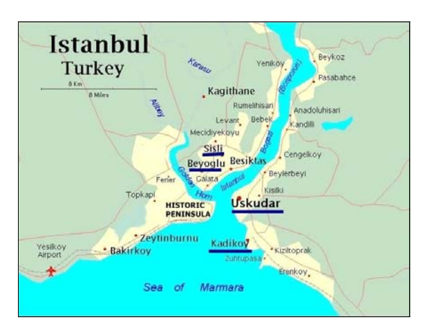
Fig. 2 Pera (Beyoğlu), Galata, Suriçi (Historic Peninsula), Şişli, Üsküdar and Kadıköy in an İstanbul map through the two sides of Bosphorus

Suriçi (Historic Peninsula) consists of Fatih, Sultanahmet, Eyüp, Beyazıt, Eminönü regions. It was the living area of old Ottoman aristocracy and bureaucracy [9], [29]. After Ottoman Empire has been declined, The Ottoman aristocracy which lost their function and economic power left Suriçi zone and Suriçi opened into middle class settlements. During these years, in Suriçi the middle and low-middle class lived within the rules of district, religious community and the patriarchal family. Being the most crowded place in 1940s, Suriçi was also the slum area of İstanbul [19], [10], [11].