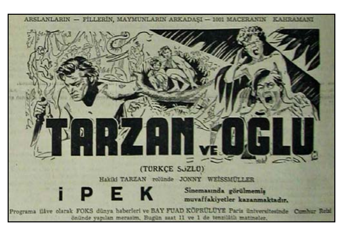
Fig. 7 The ad of the movie Tarzan ve Oğlu (Tarzan Finds a Son!) directed by Richard Thorpe. (Cumhuriyet Gazzette, 3 December 1939)

The musical films were in third rank in popularity. The genre of musical films was popular both in American, European and Middle Eastern cinemas during the war years. The invention of the sound film was still a new phenomenon during the 1940s—although it's not common in Turkey-, this is why there was a big interest in the films containing music, song and dance. The actors and actresses of these musical films were singers of operas, operettas, revues, concerts; tenors and sopranos; crowded ballet and dance groups.