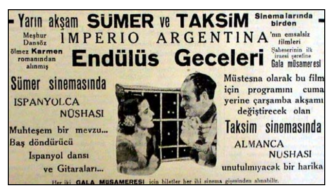
Fig. 8Endülüs Geceleri (Nights in Andalusia) was a German musical film made bilingually in German and Spanish and it was shown in Istanbul in two languages in two different cinemas at the same time. (Cumhuriyet Gazzette, 18 October 1938)

that the present domestic films were unpopular because they did not 'represent' us. Moreover, they argue that domestic films could also become popular alongside the European and American movies if they 'became indigenous'. Thus, these filmmakers started to produce films with this understanding. In order to reach a synthesis in the cinema field, they turned towards the usual, common, familiar and routine subjects. Their movies satisfied the audience and became a reference point for many cinematographers following them.