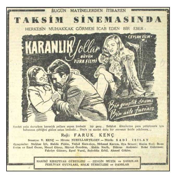
Fig. 9 A film (Karanlık Yollar, The Dark Ways, Faruk Kenç, 1948) advertisement says "in Taksim cinema a great Turkish film which everybody should see... a youth dram, a family tragedy..."

During this period, the domestic films were mainly exhibited in Taksim cinema in İstanbul. By this way, Taksim cinemawhich has been showing Egyptian and domestic movies in Pera turned into an alternative spectacular space (Fig. 9). It transformed the profile of Pera in 1940s because in those years, Pera was the place of American and European films[43]. The exhibition of different kinds of movies in Taksim cinema changed the panorama of the cinema market and indicated that non-American or non-European movies could achieve huge box-office success as well. In this period two different kinds of cinema management policies were formed. One of them was showing saloon films, and the other was showing melodrama films. During the Second World War, the 'elite-bourgeois' class theatres showing salon films weakened against the 'populist' approach of the movie theatres projecting melodrama films. This development also shows a change in mentality as well as the production.