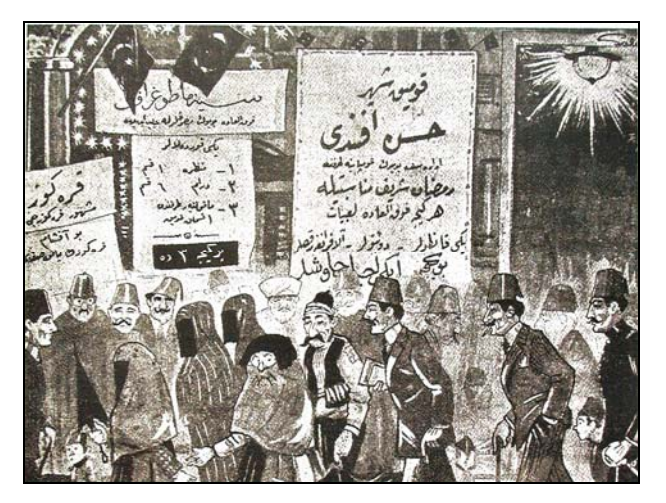
Fig. 10Direklerarası where the entertainment places settled at Istanbul in the beginning of 1900s. (Drawing Salih Erimez, Tarihten Çizgiler Mecmuası, [42])

As we understand with the debates so far, after Tanzimat reforms, the most important controversy in artistic and cultural fields was about how the national progress should take place. One solution to this controversy is to imitate Western countries for progression [13], [14], [15], [17], [18]. The other solution is to be guided by Western civilization in the historical orientation of Turkish culture. In the 1940s, the avarage audience was interested in cantos, operattas rather than the grand operas; they went to tuluat theatres more than Western theatres; they usually listened allaturea and folk music (Türkü) instead of the classical Western music. Becoming engaged in operettas rather than grand operas, tuluat theatres rather than Western theatres, allaturca music rather than classical music, the audience necessitated new searches in music, theatre and cinema. The intellectuals and artists criticized the method of imitating products of Western culture, when they realized the fact that the community pays attention to living cultural works carrying traces from their lives. In fact, this is the criticism of the transition period cinematographers about the former understanding about cinema. Unlike from past, the artists of the 1940s advocated indigenous and natural works of art instead of Westernized and imitating modern ones. Even if it is nasty, an original work of art is always better than a copy work.