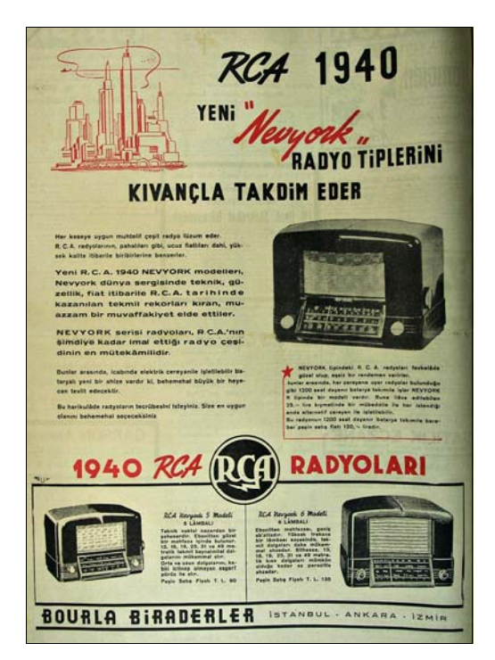
Fig. 1. One of the popular radio advertisements from a newspaper in the 1940s. The radios were very effective communication vehicles during war years. (Cumhuriyet Gazzette, 22 Ekim 1939)

With the movies, the newsreels were exhibited too in the film theatres regularly. 1940s, cinema was an instrument forforming a kind of 'national unity and social conjunction' within the country and a tool of 'gathering international information and making advertisement' outside the country. The cinema can combine 'real' and 'fictitious' and represent them together. Therefore, during the Second World War cinema was used as a propaganda tool as an information vehicle and many governments began to invest in the cinema sector. The governmental manipulations of the cinema sector during the war has been speeded up the expansion of politics and diplomacy domains into the cinema. This development can be best exemplified with the newsreels which exhibited with feature films. The newsreels became very vital because they were popular, actual, cost-efficient, persuasive, informative and exhibited anywhere in the world for a mass audience. The governmental institutions regulated newsreels and used them efficiently for legitimizing and expanding their own politics during the war years.<sup>2</sup>