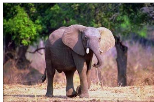
Fig.2. A sample image

We extract feature vectors of all blocks of image. Then, using a clustering algorithm such as k-means or SOM neural network, these feature vectors cluster into groups. In this work we use k-means algorithm to categorize the image blocks into k clusters. Each cluster represents a special object of the image. Then we select the m clusters that have largest members after clustering. The centroids of selected clusters are taken as image feature vectors (12-D vector for each centroid) and indexed into the database. In our experiments we sets k=10 and m=5 . A sample image is depicted in Fig.2 and five representative features of the major objects are listed in Table 1.