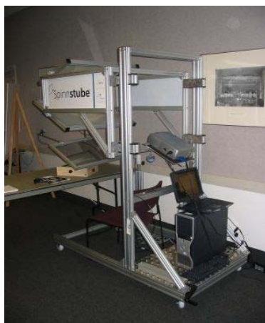
Fig. 1 A module of the ARiSE platform

The project will implement three prototypes based on three interaction scenarios. The 1 st prototype is targeting Biology.