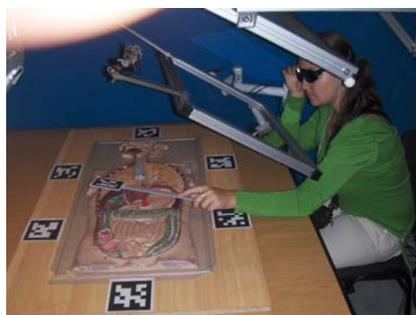
Fig. 2 User performing the 1 st exercise

Five user teams from 4 countries (Germany, Lithuania, Malta and Romania) participated at the summer school with a total of 20 students from which 10 boys and 10 girls. None of the students was familiar with the AR technology. 16 students were from 7 th form (13-14 years old) and 4 from 11 th form (16-17 years old).