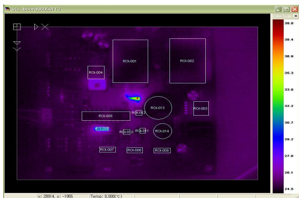
(A) Infrared Image of Frame 1