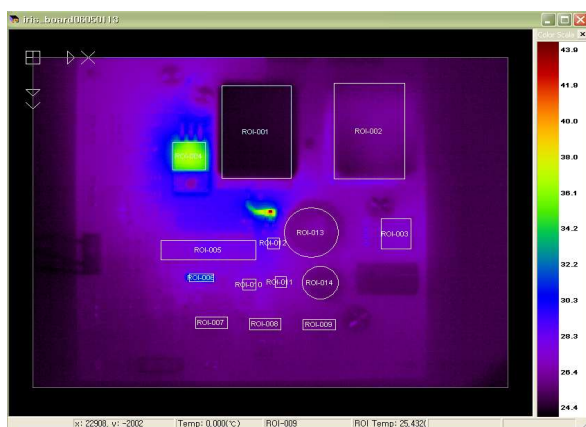
(B) Infrared Image of Frame 200