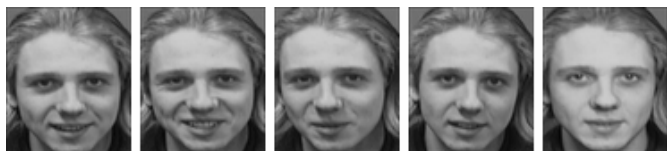
Fig. 2 Example of the images concerning one class

Matrixes \mathbf{X}_k were made of various sets of these vectors for each class. Number of vectors in matrixes was varied from 1 to 5 to reveal the dependence of recognition probability on the number of the elements in a class. Fig. 2 shows an example of five images of one person (class) on which one of 5600x5-matrixes \mathbf{X}_k was generated.