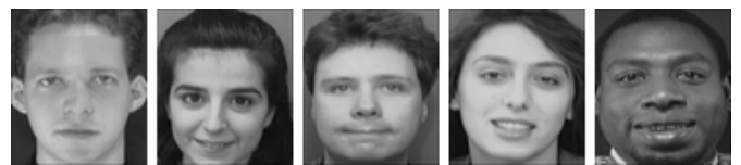
Fig. 1 Several face images from ORL Database

The experimental research of the qualifiers constructed on the basis of the described above indices of conjugation was made with the use of standard database ORL. The given base contains images of 40 persons. There are 10 various photos with different mime (for each person). Thus, the database contains 400 images. Fig. 1 shows samples of these images (one image per person).