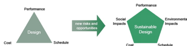
Fig. 2 The shift to Sustainable design