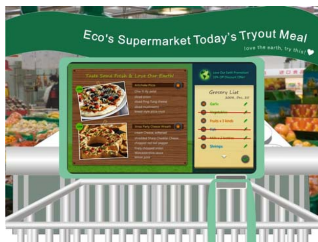
Fig. 4 Screen showing low food-mile try-out dishes

The second phase is to integrate design into the primary platform scheme, present the image with computer, and add the scenario instructions so that the users would have the simulated experience of the utilization of the platform. In addition, we also interview the users about their feelings on the different technologies in the content of the platform. We interviewed four participants, and each participant has received the introduction of the platform concept, scenario instruction, and the process of two major task procedures. Researchers briefly described the concepts and gave directions to the participants, allowed the participants to decide the operation steps. In the experiment they can express their feelings about the technologies and elements in the platform. After the task is done, the researcher would re-interview the participants on their overall feelings about the platform.