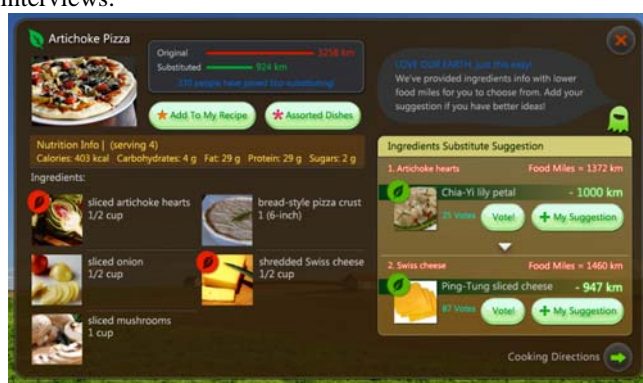
Fig. 3 Recipe of low food-mile ingredients

At this phase, we established the flow model in order to identify the network between meal preparation and material purchase, and define efficiency-oriented type of persona as the recruit target of primary user. The participants included seven mid-class housewives who were the deciders of their daily household purchases. Every participant cooks at home, and does grocery shopping once or twice a week. We provided 200 NTD for each interviewed participant as the rewards. We interviewed three participants. We defined task activities, and made the participants proceed the paper prototyping based on the primary project of the wireframe, in order to identify that the if the sustainable concept delivered through the platform is proper or not, and if it is conform the anticipation of the users. In addition, we adjusted the design based on the result of the interviews.