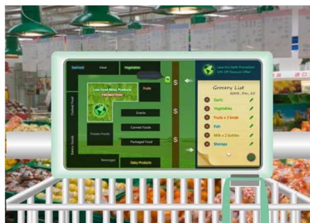
Fig. 5 Screen showing dynamic map of store and indicating the low food mile ingredient zone