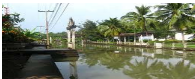
Fig. 2 Environment in Bang Khonthi