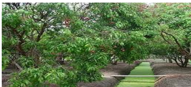
Fig. 4 Agriculture Area