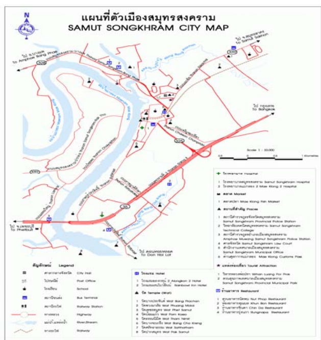
Fig. 1 Map of Bang Khonthi Samut Songkram