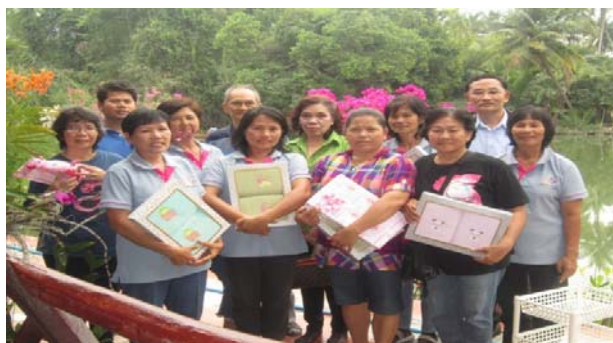
Fig. 7 Ruk Bang Khonti group

We have suggestions in two main aspects which are a policy and a suggestion for the entrepreneurs of the resort in Bang Khonthi district, Samut Songkram. A suggestion regarding the policy for Bang Khonthi district including the whole province of Samut Songkram is that there must be a support for an ecotourism which emphasizes arts, culture, and the beauty of the way of life. Also, the nature must be preserved by raising more awareness of tourists towards its importance to all life on earth. The local people should be encouraged to form a network such as Ruk Bang Khonti group which lets them share opinions and help one another. Eventually, this will lead to a learning process and an experience accumulation. In order to develop the tourism in this particular area, the policy should not be done hurriedly or by comparing with others. The main goal is to let everybody become involve and thoroughly have them experience the most out of the development. Hence, it can be said that living in accordance with the philosophy of sustainable economy is one approach leading to a real strong community as people are always reminded of a cautious life.