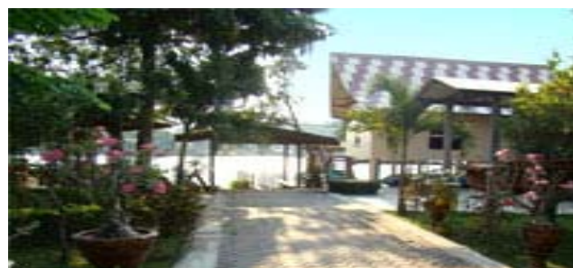
Fig. 5 Lodging in Bang Khonthi