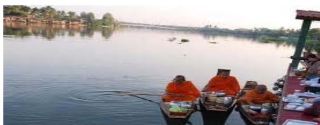
Fig. 3 Morning Culture