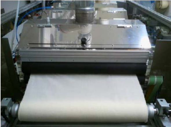
Fig. 1 Innovative Veneto Nanotech machine Nanofabia for in-line treatment of fibrous and web materials

For a deeper comprehension of nature and origin of the observed properties, fundamental studies of the interaction of cold atmospheric plasma with fibrous materials were performed at Veneto Nanotech on wool [2], cotton [3], polymeric, basalt and titania fibers. It was proved the formation of a nano-structure on each fibrous species. Authors suppose the preponderant role of the nano-scale roughness (in the range of tens of nm) generated on fibres by the atmospheric plasma for noted before properties of fibrous and textile materials. In any case, the observed variation of fibres morphology is always combined with chemical modifications the fibre surface, i.e. with generation of polar groups and radicals [4].