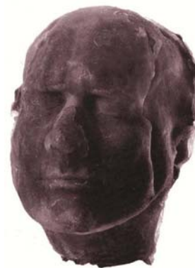
Fig. 6 Marc Quinn, 1991 'Self' (sculpture) New York

For several years he had been collecting and keeping his blood in the fridge, then filled in the form of his head, created a self-portrait. For creating this figure he used blood approximately by volume equals to the blood of a man of average years. This is stored in the New York Museum of Modern art. Thus, taking medical analysis of human DNA contents, which is the achievement of genetic engineering artists began to create their works of art. Also the huge interest is arisen to the biological nature of man to his particular ancestor history and personal characteristic features. In general, a modern work of art has squeezed its artistic scope and start brining information from different areas of anthropological sciences. In such situations a character perceiving and creating as an object becomes the subject and is grouped, and is perceived as a literary text around a man.