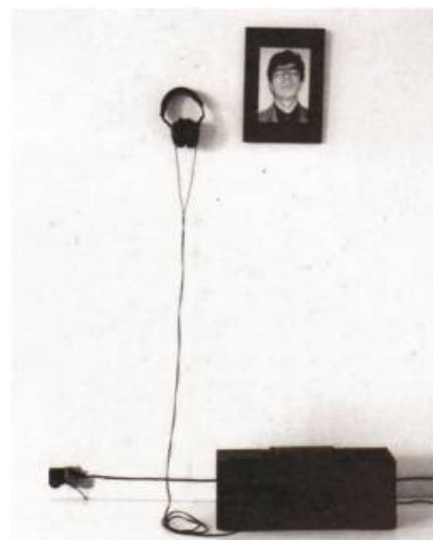
Fig. 11 Vadim Dergachev, 2006 'Dead project' (installation)