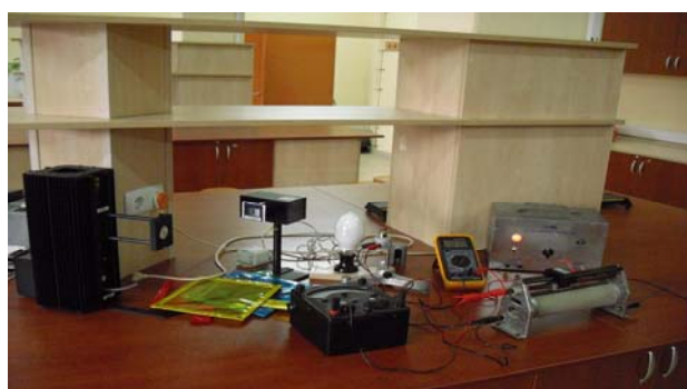
Fig. 2 Real experimentation materials regard photoelectric effect

The physic achievement test was applied again to the experimental and control groups as a post-test. The SPSS 11.00 (Statistical Package for Social Sciences) statistical program was used to evaluate all the data collected from pre-and post-tests. The independent samples t-test, one way anova and tukey hsd test were used for testing the data obtained from the study at 05 level of significance.