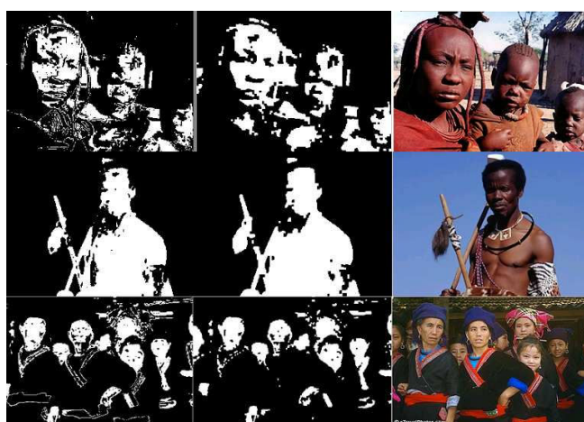
Fig. 4. Skin color regions segmented using non-adaptive GMM (left), proposed method (middle), and the original image (right).

An adaptive skin color segmentation algorithm based on Gaussian Mixture Model (GMM) has been proposed which can adapt the model parameters to cope with the changing imaging conditions such as lighting and noise. The algorithm considers the higher level a-priori knowledge of spatial and temporal relationship between the pixels in a video sequence. The experimental results show the superiority of the proposed algorithm compared to non-adaptive parametric models. Further improvement can be achieved by incorporating application specific information such as human motion models or face-hand detectors. The proposed method may also be used in surveillance systems and motion detectors.