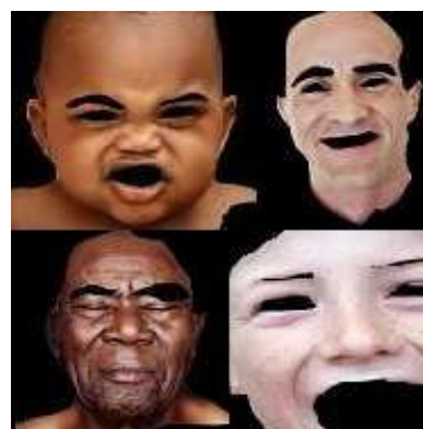
Fig. 2. Manually segmented training data.

compared to their correspondences in the last frame in the sequence given in frame 3. Four small regions have been