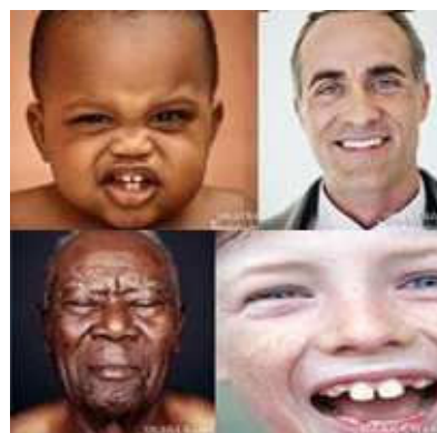
Fig. 1. Samples from training data.

The initial training of the Gaussian components is carried out using a data set of skin color pixels that includes 127,352,563 pixels. The training images have cautiously been selected to cover almost all ethnic groups and imaging conditions. The training images were manually segmented before parameter estimation. Figure 1 shows a subset of the training images and Figure 2 shows them after being manually segmented. The color space used is YCbCr. To reduce the effect of illumination, Y channel has not been considered through out the segmentation process. We start the initial EM stage with five components. This assumption is based on our intuitive classification of the skin samples using their appearance color. The second stage of EM algorithm tries to optimize the number of components. According to the results of this stage, the optimum number of components is seven. The adaptive algorithm uses the results of this stage for segmentation. Figure 3 shows a sequence of frames indicating changes in lighting condition. Some pixels from the first frame have been