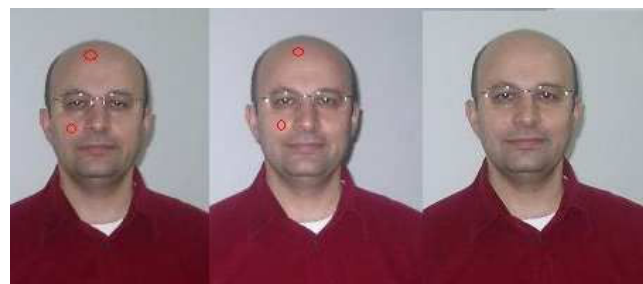
Fig. 3. A video sequence with changing lighting condition.

compared to their correspondences in the last frame in the sequence given in frame 3. Four small regions have been