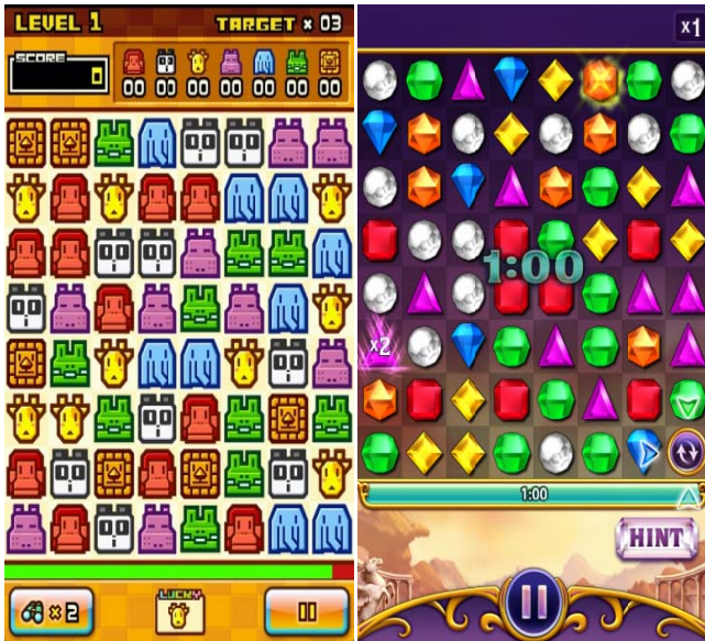
Fig. 2 Zookeeper (Left) & Bejeweled Blitz (Right)