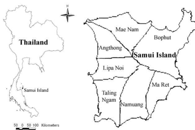
Fig. 1 Location of study area on the Samui Islands

Three larval indices: House Index (HI), Container Index (CI), and Breteau Index (BI) were worked out as per standard WHO guidelines. Breeding places were sampled both indoors and outdoors within 15 m of the houses [10], [35]. The jars were classified into two categories: small jars (<100 L) and large jars (≥100 L) [36].