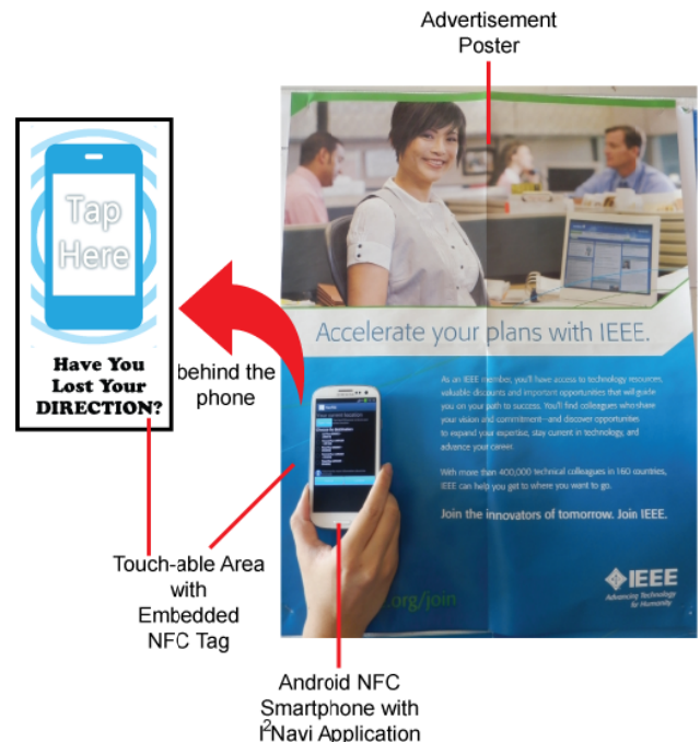
Fig. 3 Implemented I 2 Navi system

smartphones were used as read/write devices for the development of the NFC tags. A set of these NFC tags were then embedded in several existing advertisement/information posters. The NFC tags embedded posters were placed in various locations within the building. Each tag contains related location information.