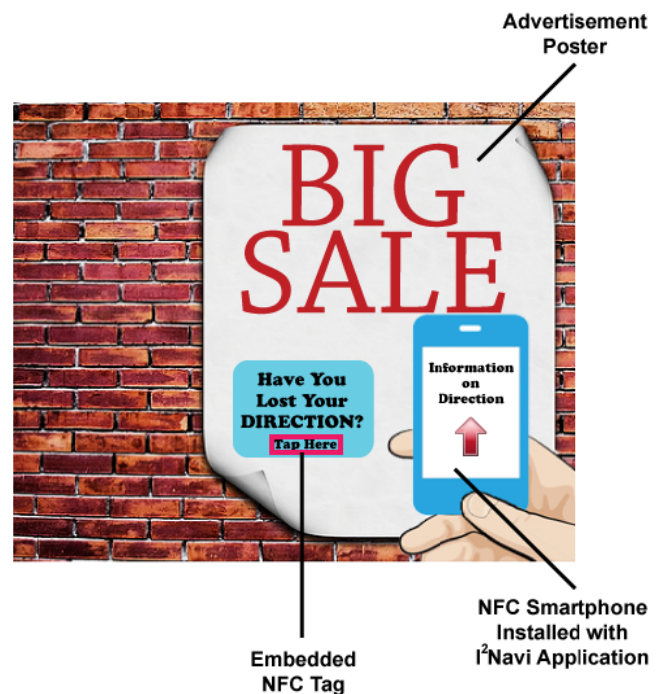
Fig. 1 Hardware components of the I 2 Navi

The I 2 NAVI uses NFC tags and an NFC enabled Android smartphone with the customized I 2 NAVI navigation application to provide a cost effective indoor navigation system, as shown in Fig. 1. Each NFC tag has a unique identifier and is used to store location information such as coordinates which is used to search for a destination point within the system. The number of tags required depends on the size and intricacy of a building. For instance, buildings with many floors and wings will need more tags for a more effective navigation. These NFC tags can be embedded in existing advertisement posters with a marked dedicated space for users to access for direction (see Fig. 1). When activated, the I 2 NAVI navigation application, installed on the Android NFC-enabled smartphone, will be able to read information such as the current location from the NFC tag and subsequently guide the user through a directed path on the floor plan via smartphone's screen to the intended destination.