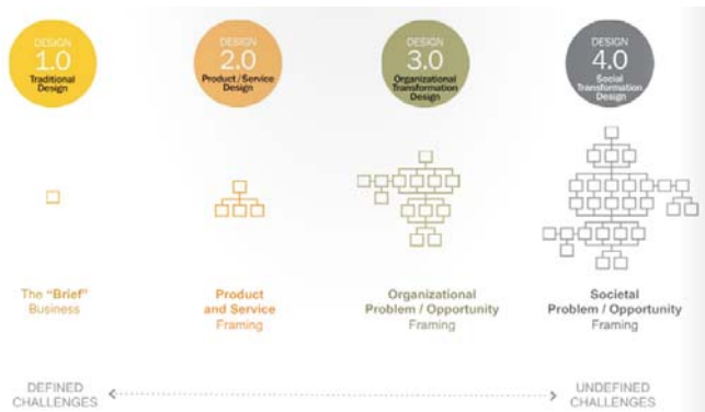
Fig. 3 Challenge Fuzziness Shift [8]

On the other hands, Korean academics have been talking about how the Public Design 1.0, which is to design public spaces in the traditional method, has changed to Public Design 2.0. There are three purposes to public design 2.0. First is for the government, design specialists, and the civil society to have seamless communication and cooperation. Second, is to have a design that has a long-term infrastructure in the perspective that public projects' resources should not be wasted because it uses the people's taxes. Third, is to make a more elaborate process which includes the vision, mission, and action plan, etc.[1] To fulfill the three purposes of public design 2.0, the participation of the people will be necessary, and it is expected that the community design will encourage participation, moreover, work as the role model for the public design.