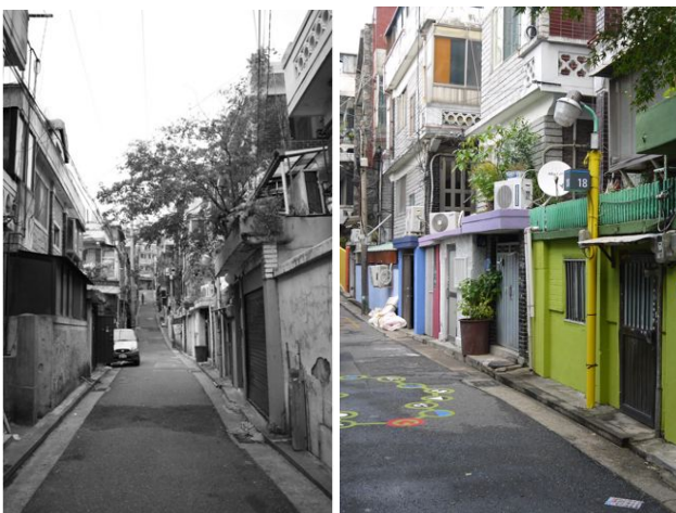
Fig. 7 Revitalization of the street through community design [5]

The Seoul metropolitan government and the crime prevention design team first decided to survey the resident's insecurity of crime and create an 'insecurity map'. As reflected in this map, they identified the places where people felt most fear they were able to make walking areas and improve the environment of the 'insecure' areas.[5]