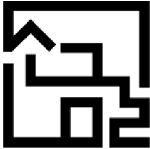
Fig. 9 So-geum-gil(Salt road) Symbol mark[5]

In the map of the 'Salt road', marked in yellow is course A which is 1.1 km, and marked in light blue is course B which is 0.6 km. Each course has different themes such as meditation road, power walking, healing point, resting area, etc. In the area where course A and course B meets, there is a place called the 'So-geum-na-ru (salt port)'. This area is open 24 hours a day. It is not only used as a surveillance area, but also a 24 hour convenience store where residents can easily purchase good and medicine, even at late hours.[5]