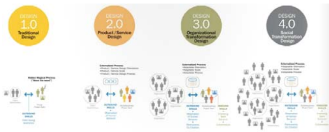
Fig. 1 When Design Begins is changing [8]

The community design has the properties of Design 4.0, which is the emerging design these days. Depending on social change, the meaning of design also has changed from the traditional product-centered design to the human-centered design through user participation. In this flow, NextD presented a framework about Design 1,2,3 and 4. Design 1.0 is traditional design as making. Design 2.0 is product and service design as value creation and design integrating. Design 3.0 is requires a inclusive design process as organizational transformation design.[6] And design 4.0 is social transformation design. In Design 3.0 and Design 4.0 there is more need for open challenge framing, more need for deep local human-centered sensemaking. Design 4.0 has challenges of country, society and planet.[7]