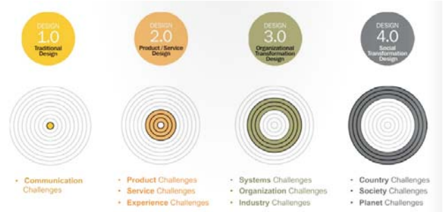
Fig. 2 Challenge Scale [8]