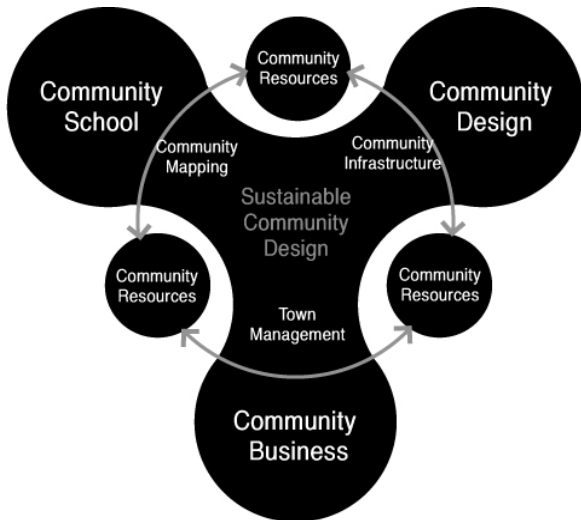
Fig. 4 Sustainable Community Design [3]

of community mapping, each region can have its own community infrastructure, and each region can have town management activities to foster businesses in each community.[3]