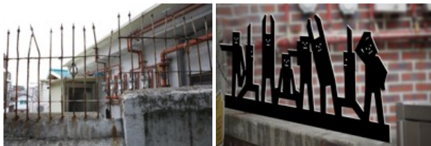
Fig. 6 Revitalization of the street through community design [5]