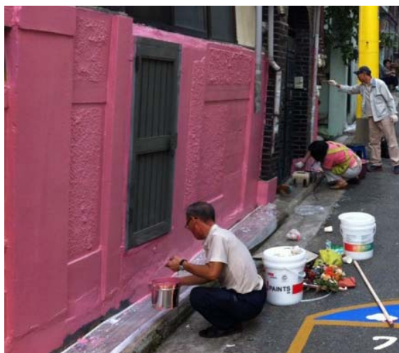
Fig. 12 The residents who participated in 'Alley Atelier' Project [5]