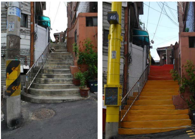
Fig. 5 Revitalization of the street through community design [5]

Before any further analysis, this paper will describe the specific details of the crime prevention design project. This project was launched in Seoul to revitalize the community and to promote natural surveillance to prevent and control crime. It enabled residents to live peacefully in crime-ridden districts.