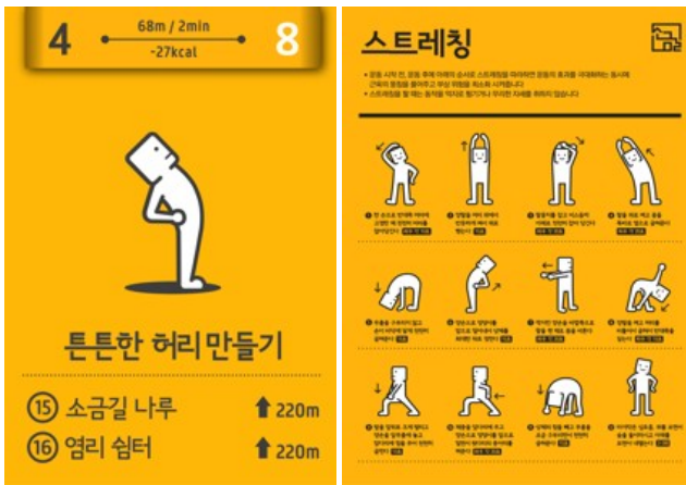
Fig. 10 Exercise program guide of So-geum-gil [5]

In the map of the 'Salt road', marked in yellow is course A which is 1.1 km, and marked in light blue is course B which is 0.6 km. Each course has different themes such as meditation road, power walking, healing point, resting area, etc. In the area where course A and course B meets, there is a place called the 'So-geum-na-ru (salt port)'. This area is open 24 hours a day. It is not only used as a surveillance area, but also a 24 hour convenience store where residents can easily purchase good and medicine, even at late hours.[5]