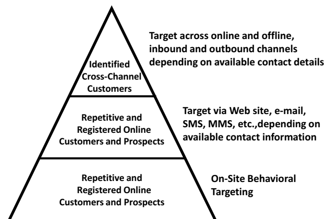
Fig 2 Actionable levels of visitor identification

The channels through which these initiatives can be executed (Web site, e-mail, offline, etc.) will depend on the level of each site visitor's registration, ranging from anonymous browsers to recognized repetitive visitors, to registered, known customers (see Fig 2).