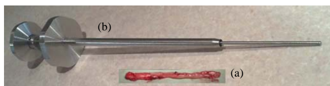
Fig. 3. (a) New fistulectomy set. (b) Excised tissue from the patient body.

After removing the device, a lumen with a small diameter approximately equal to 8 mm remained in patient body. This test showed that the new device is successfully capable of