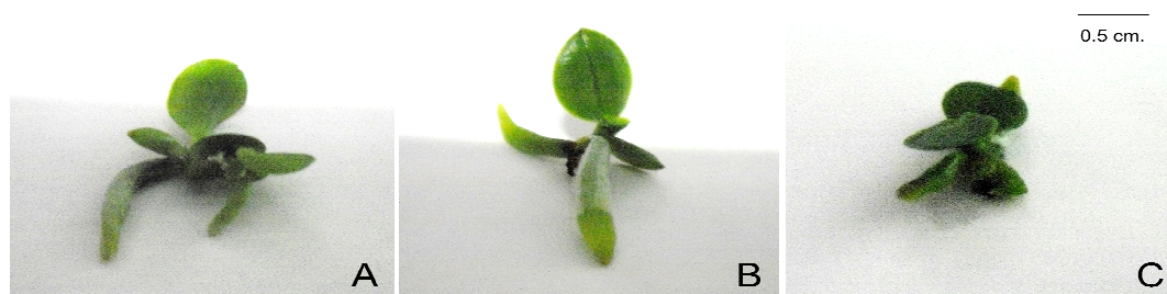
Fig. 1 Growth of Phalaenopsis ‘Silky Moon’ protocorm-like bodies on treated 25ml solid Hyponex medium cultured for 14 weeks A = 150µL of 5.25% sodium hypochlorite; B = 30µL of 2.5% iodine + 2.5% potassium iodide: 2% merbromin solution (1:3); C = control (autoclaved medium)