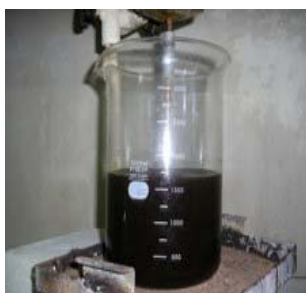
Fig. 4 HNO 3 Digestion of Rare Earth Hydroxide

To remove medium rare earths and heavy rare earths, the rare earth oxides after cerium removal was digested with nitric acid and diluted with water. The digestion of rare earth oxide with nitric acid, stage five of the flow diagram, is shown in Fig. 4. At this stage the color is red brown. Then the solution was precipitated with ammonium hydroxide at about pH-6.9-7. After precipitation, filtration was carried out. The precipitate is medium and heavy rare earth hydroxides and the filtrate was used for precipitation of other rare earths.