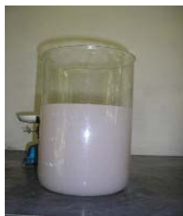
Fig. 5 Precipitation of Lanthanum

After removal of other rare earths, the solution was precipitated with ammonium hydroxide at pH-7.9, lanthanum hydroxide was obtained. Then filtration was carried out. The filtrate was then precipitated again at pH-9.6 to get more purify lanthanum oxide. After adding these two precipitates at pH 7.9 and 9.6, this precipitate was digested again with nitric acid. The precipitation of lanthanum hydroxide, stage seven of the flow diagram, is shown in Fig. 5. Then selective precipitation was made according to the above procedure in order to obtain high purity of lanthanum oxide and the precipitation was carried out about three times.