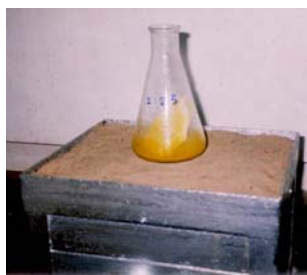
Fig. 2 HCl Dissolution of Hydrous Metal Oxide Cake