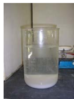
Fig. 6 Lanthanum Oxalate after Three Times Precipitation

6. Lanthanum oxalate was obtained and calcined at 1000°C. Then 96% of lanthanum oxide was obtained. It has white color.