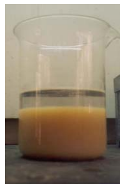
Fig. 3 Precipitation of Rare Earth Hydroxide

The acid solution (filtrate from Hydrochloric Acid dissolution) was precipitated with ammonium hydroxide. Other associated minerals hydroxide was precipitated at pH-5.8, and rare earth hydroxide was precipitated at pH-11. The rare earth hydroxide was dried in the drying oven at 100°C for one hour. After that, it has yellow color. Precipitation of rare earth hydroxide, fourth stage of flow diagram, is shown in Fig. 3.