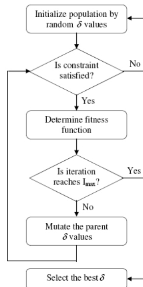
Fig. 1 EP steps for determining the optimal \delta

The core of the proposed approach is to recognize the optimal modulation index \delta for the FM signal, which is generated for the pulse train so as to drive the ballast operation. The modulation index decides the range of frequency to be deviated in the FM signal from the carrier. Hence by using EP, the optimal \delta is determined and the steps for determining the optimal \delta are depicted in the Fig. 1.