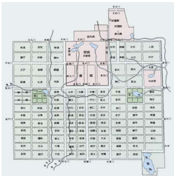
Fig. 1 The City of TangChang'an, represent li fang

continued, which the enclosed residential area of ordinary people was called li fang since the Sui Dynasty. Along with the economic growth in the Tang Dynasty, the residential form of li fang gradually disintegrated, coming into being the form of fang xiang in the northern Song Dynasty. However, the differentiation of residential areas did not collapse according to the hierarchical system.