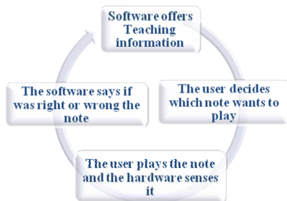
Fig. 4 System Dynamic

The main result was the successful implementation of hardware device that captures the basic musical notes which are being played on a flute and transmitted to the computer, where the interaction is consistent and efficient.