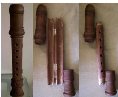
Fig. 2. Designed flute

The Fig 3 shows the implemented prototype of housing, which allows opening the main tube, to give the possibility to locate the electronics needed to operate.