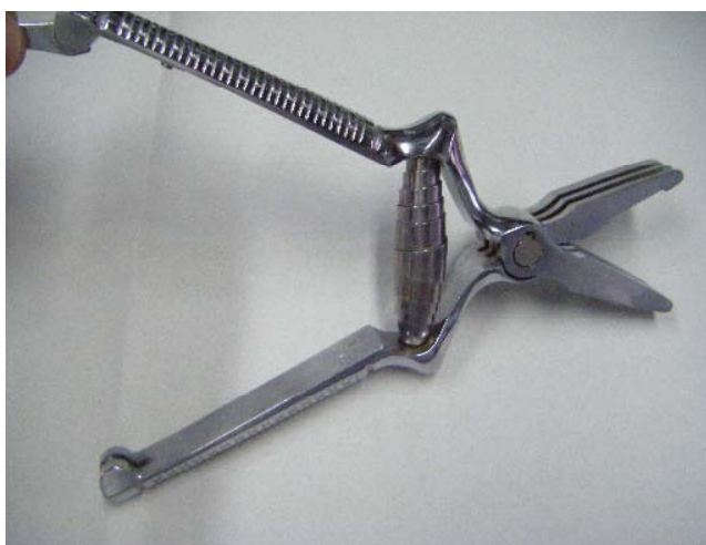
Fig. 1 Manual device used in this study for grinding the coated fish stick products

Six samples of each group were assayed at three different temperatures, 37 \pm 1 °C, 50 \pm 1 °C and 80 \pm 1 °C.