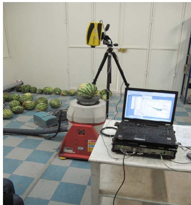
Fig.2. LDV sensed response of the fruit in upper surface as output signal

After determining the vibration response of the samples and measuring their weight, they were cut at the midpoint. Then watermelons were sensory evaluated. Seventeen panelists graded the fruits in a range of ripeness in terms of overall acceptability (total desired traits consumers). The fruit ripeness indices were scored on a scale of 1–5 (1: unripe, 3: ripe, and 5: overripe).